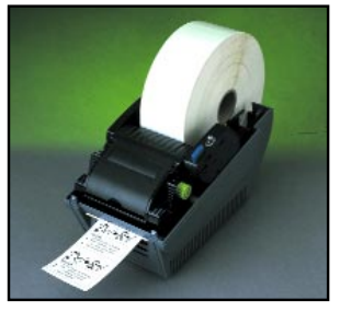
500 foot media roll option.

Del Sol is the most versatile desktop printer on the market with leading edge power, performance, and a low price point.